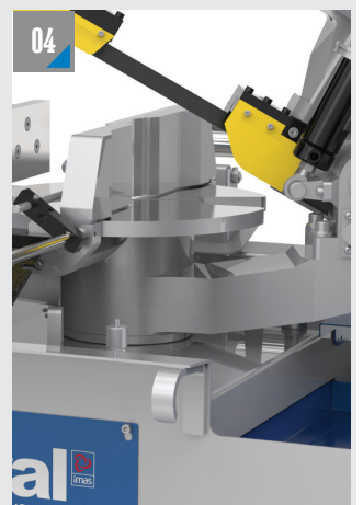
AÇILI KESİM MITER CUTTING