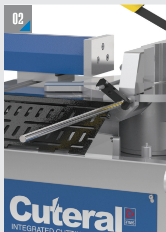
MALZEME DAYAMA MİLİ MATERIAL STOP SPINDLE