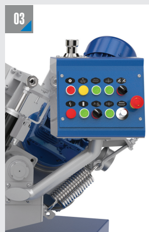
KUMANDA PANELİ CONTROL PANEL